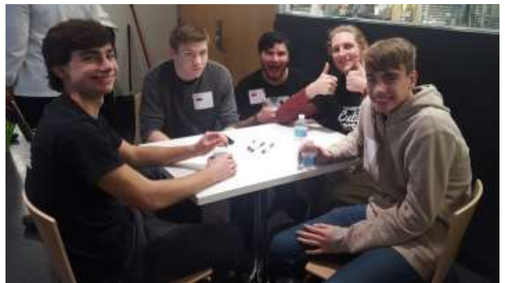
JJC Culinary Arts Open House