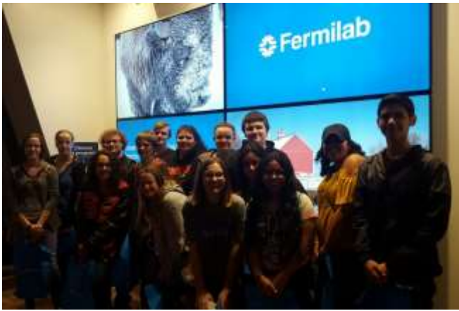
Fermilab Stem Expo