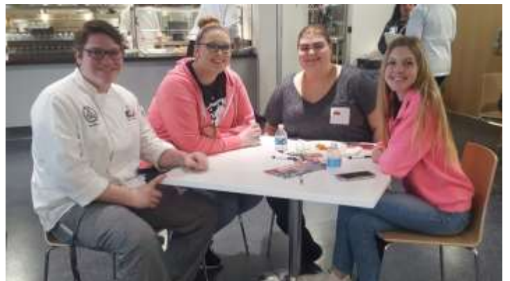
JJC Culinary Arts Open House